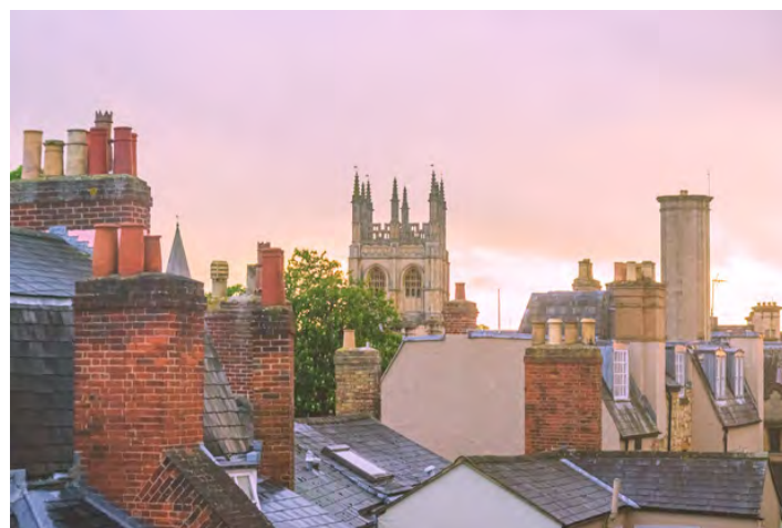
View from my first-year accommodation.

For most of my school career, I didn't see Oxford as something attainable. While the prospect of an Oxford degree may seem ideal in theory, imposter syndrome - the unjustified feeling that you're not good enough - nearly deterred me from ever applying. Personally, I would never have made the leap if it wasn't for the virtual encouragement of people who had been in a similar situation to myself. I hope that this magazine can provide part of that encouragement for those of you out there who are currently unsure as to whether Oxford is the place for you.