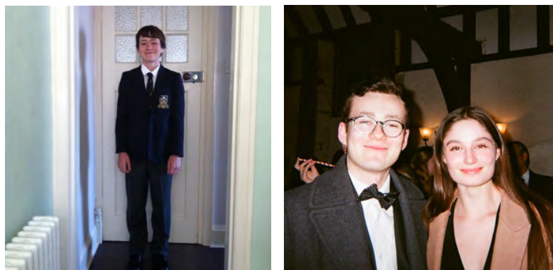
From school tie to slightly wonky black tie.