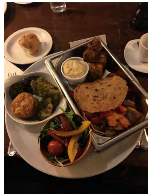
Vegetarian meal at a formal.

I often visit a library before or after going to a café to get the books I will need for that day and return the ones that I have finished with. I don't work in a café every day as this would be expensive so I will regularly stay at a library and work there.