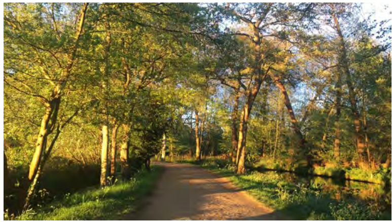
Christ Church Meadow at dusk.

At about 7 I meet my friends for dinner in the kitchen where we each cook (sometimes for each other) and eat together. After dinner we often do things together such as go to an event or do an activity such as getting ice cream, going ice skating, etc. Each week I will have a newspaper meeting and although this term they have been via Zoom, in normal circumstances they often take place in the evening. When I return to my room, I generally do a bit more work and also finish off the journalism work I need to do for the day. When I have finished I read a book or watch something on Netflix to relax before I go to sleep.