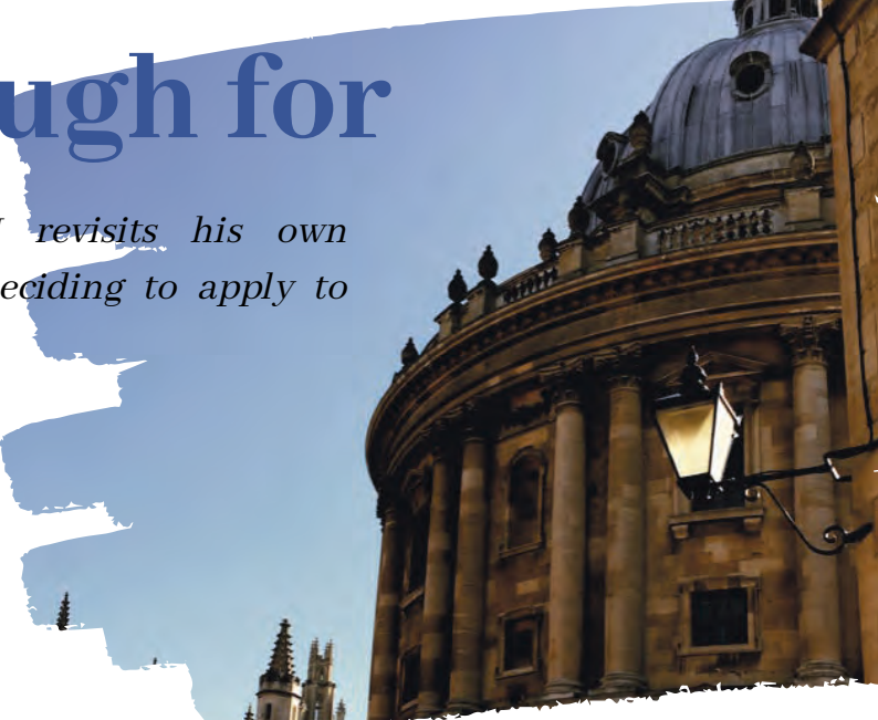
The Radcliffe Camera: a one-stop shop for historians and Instagrammers alike.

However, I eventually decided to give Oxford a shot. There were five spaces on my UCAS form, and even if Oxford didn't work out, I still had other four universities with better odds of getting into. I was also lucky enough to have several teachers who supported me in my application, despite lacking the level of insight into the