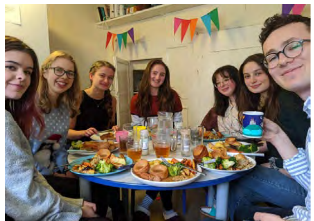
Dinner with friends in the kitchen and at a formal

After the run I shower, change, and then continue to work in my room until dinner. This generally includes working my way through the reading list and making notes on the works to build the material for my weekly essay. I sometimes go through and highlight particularly interesting parts or areas that are especially useful for my essay. The day before my essay is due, I start writing and my day consists of writing the essay rather than reading for it. Just before dinner I take a break and use this time to call friends/family or just to relax.