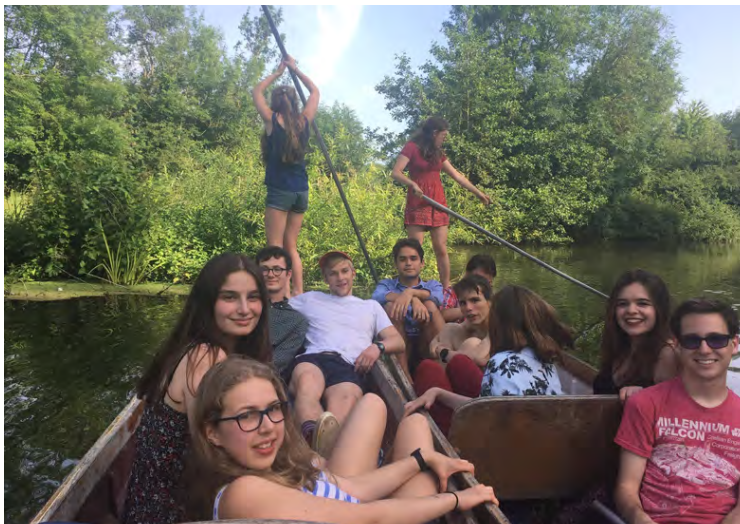
Punting with friends at the end of Trinity term.

After the class I often met my friend to go for a run together. There are lots of great places in Oxford to run and I particularly enjoy the range of parks and green spaces.