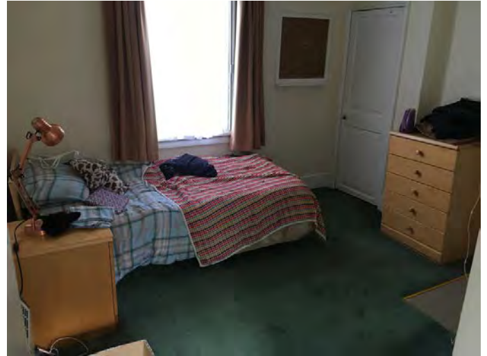
My room in my 2nd year.

I'm generally a late riser and don't get much done in the morning. My day starts slowly, generally with a cup of tea and answering emails. I'm an editor for one of Oxford's student newspapers so I often use the morning to edit and commission articles. I aim to do some work before lunch, generally making notes on a book from the weekly reading list. The great thing about being a History student is that your timetable is flexible. As someone who is definitely not an early bird this suits me and how I like to work.